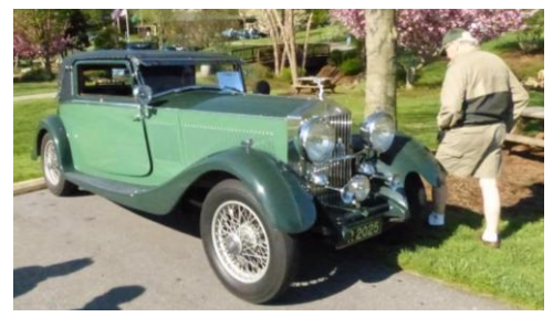
1934 Rolls Royce

"Long Distance" plaque, but the real surprise and honour was being presented with the "Spirit of Adventure" award! Something about persevering through blizzards and such!