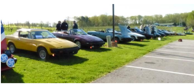
A whole lotta Wedges